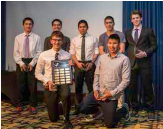
NWT Junior Men's Basketball Team Team of the Year

Sport North has launched a new updated website to provide the members and public with an enhanced hub of information, while integrating Sport North's social media portals (Facebook, Twitter, Instagram and YouTube). The website received regular updates throughout the year to keep members and the public aware of events and sport initiatives within the NWT and beyond. This provides our members with current information and readily accessible resources.