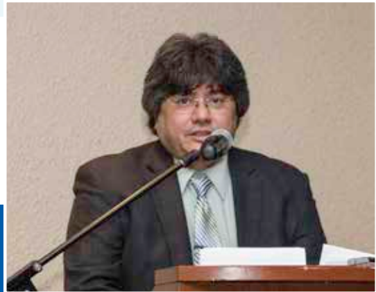
Northwest Territories Power Corporation Corporate Contributor